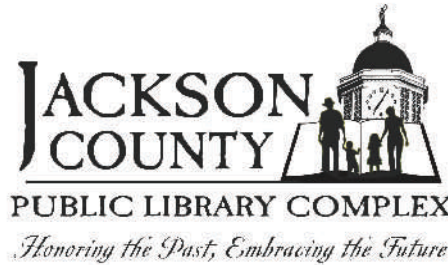
Capital Campaign Logo

When I think back one year, I remember that the plans for the Capital Campaign were hazy, at best. Now the forward momentum of this campaign is amazing. Since the last issue of this newsletter, several important steps have been made in the Capital Campaign for the Jackson County Public Library Complex. The campaign leadership has been working diligently to keep the project moving forward.